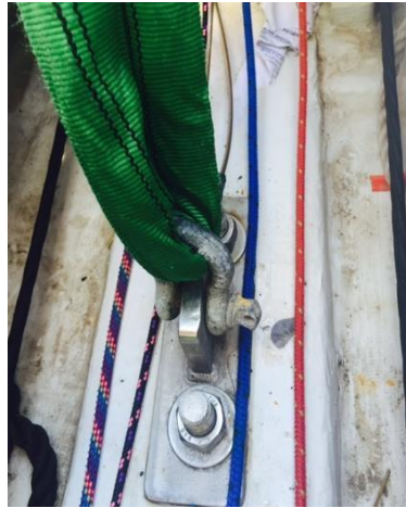
Fig 2. Shows properly rated shackle and lifting strap with tag.