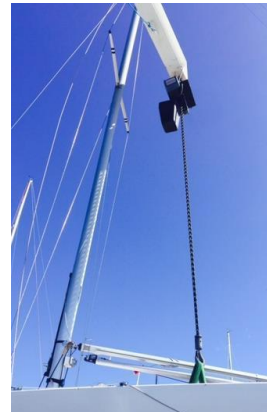
Fig 3. Shows that the vessel is securely attached at the fixed lifting points and the hook of the crane. Also correct alignment of crane to vessel.