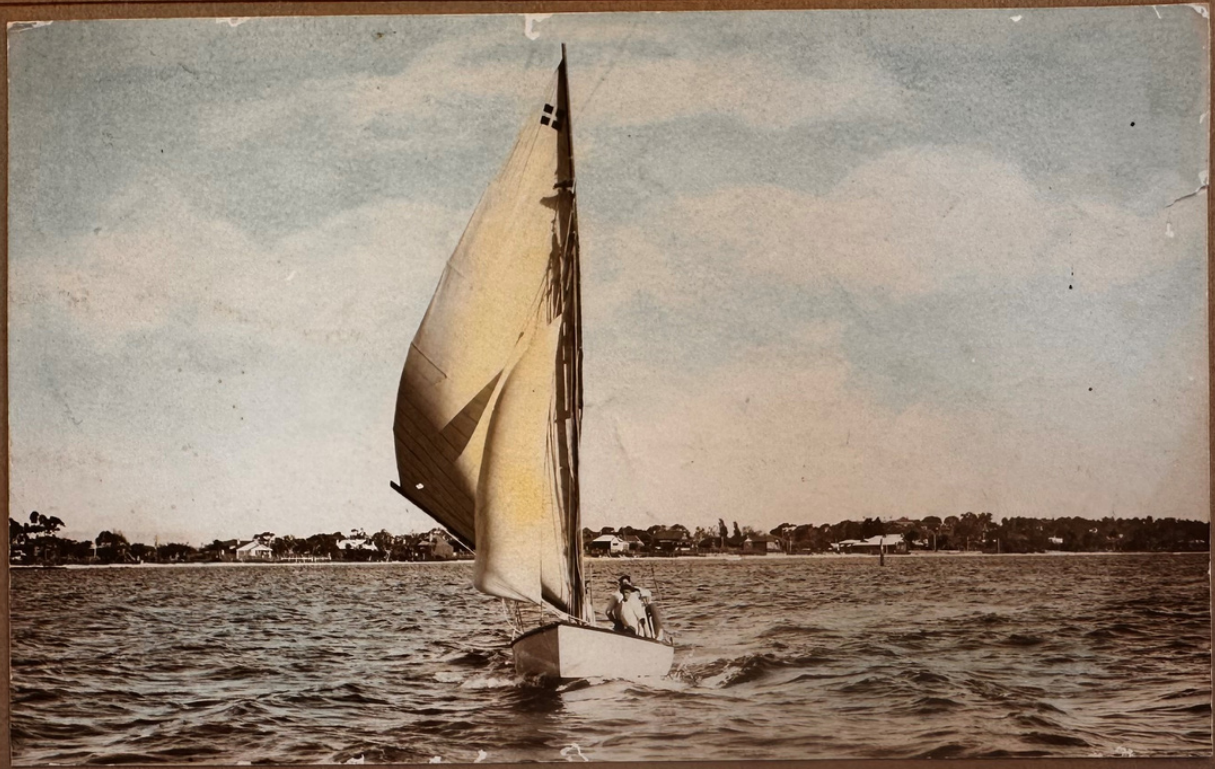
Yachting on the Swan